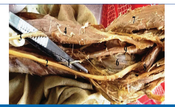
[Table/Fig-6]: Branch of the median innervating the brachialis muscle (Anterior View). 1- Branch of the median nerve to the brachialis muscle; 2- Median nerve; 3- Musculocutaneous nerve; 4- Biceps brachii muscle; 5- Superficial head of the brachialis muscle; 9- Brachial artery brachialis muscle; 7- Brachiorardialis muscle; 8- Pronator teres muscle; 9- Brachial artery

Deep head of the brachialis muscle; 2- Branch of the radial nerve supplying the brachialis muscle; 3- Radial nerve; 4- Superficial head of the brachialis muscle; 5- Biceps brachii muscle; Brachioradialis muscle; 7- Extensor carpi radialis longus muscle; Pronator teres muscle