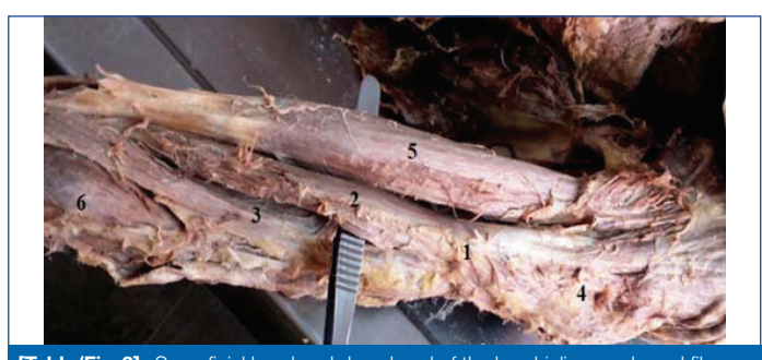
[Table/Fig-2]: Superficial head and deep head of the brachialis muscle and fibres of the deltoid muscle contributing to the superficial head of the brachialis muscle (lateral view). 1 - Fibres of the superficial head of the brachialis muscle originating from the deltoid muscle; 2 - Superficial head of the brachialis muscle; 3 - Deep head of the brachialis muscle; 4 - Deltoid muscle; 5 - Biceps brachii muscle; 6 - Brachioradialis muscle

insertion. They were firmly adherent to the underlying bone. Both the heads were loosely adherent to each other in the proximal part but distally the adjacent fibres were adherent and were blended to variable extents. In three (3.6%) specimens, the SH with tendinous origin could be easily lifted from the bone till their insertion and there were no intermingling of superficial and deep fibres.