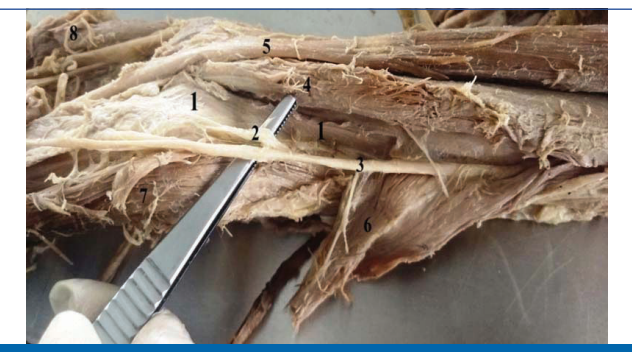
[Table/Fig-5]: Radial Nerve supplying infero-lateral part the Brachialis Muscle (Anterior View).

Supericial head of the brachialis muscle; 2- Belly and tendon of the biceps brachii muscle; Tendon of the supericial head of the brachialis and biceps brachii to be inserting on to the radial tuberosity and to anterior border of the radius (arrow); Deep head of the brachialis Deep head of the brachialis